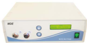
Control Unit Part No : LM 10000000