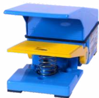
Foot Switch Part No : LM 10010000